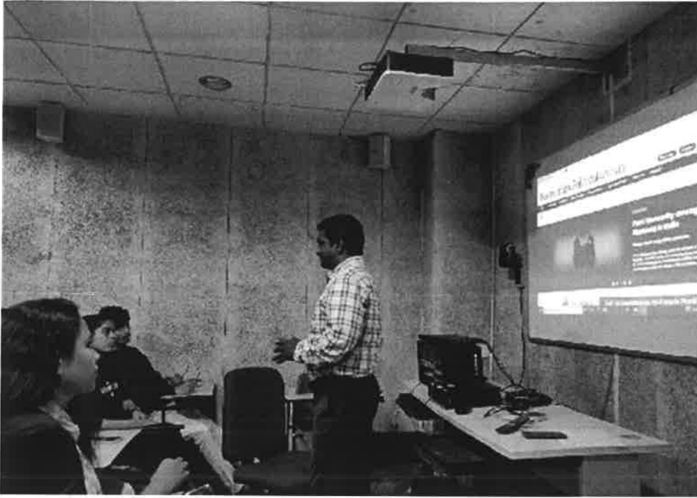
Speaker giving the speech